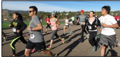
5k/10k Race Start-2014

A special THANK YOU to all our volunteers, participants, and Sponsors. Without you, this event would not be possible