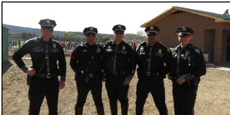
NMSP Provide Traffic Control-2014

Every participant will be placed in a random drawing at the conclusion of the awards ceremony and have the chance to win donated items! Bring the whole family out for a fun healthy event and support a great cause!