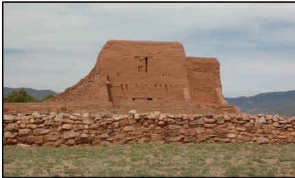
10K Turnaround from inside the Park

The 10K course is one of the most scenic and historic in all of New Mexico. Beginning at Pecos High School the course takes runners through the